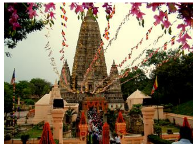
Mahabodhi Temple [24.6959, ° N, 84.9914 ° E]