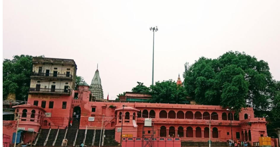
Falgu Ghat [24.7778, ° N, 85.0097 ° E]