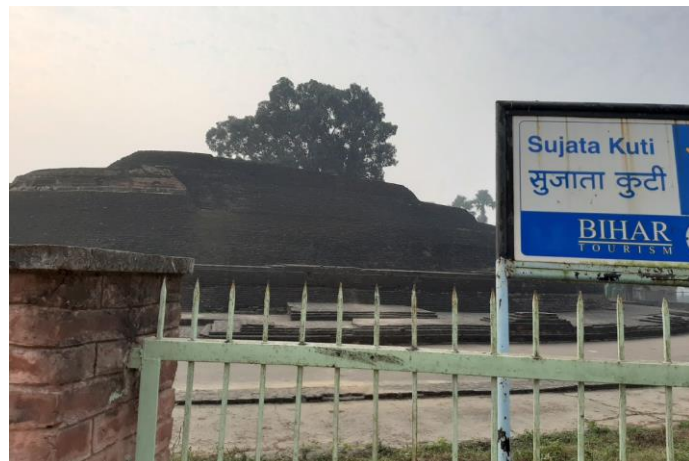
Sujata Stupa [24.6980 ° N, 85.0033 ° E]