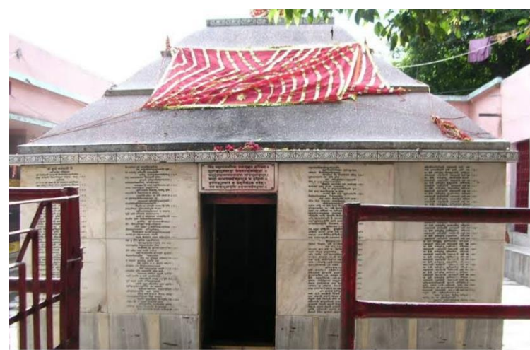
Mangla Gauri Shrine [24.7750 ° N, 85.0023 ° E]