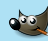
GIMP Image Manipulation Program