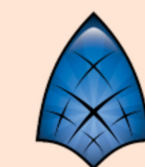
Synfig Studio 2D Animation Software