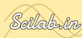
Scilab Numerical Computation