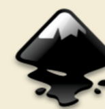
Inkscape Vector Graphics Software