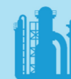
DWSIM Chemical Process Simulator